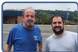
Our District Maintenance Team