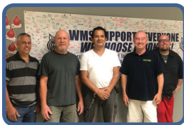
Our WMS Team