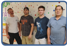
Our HHES Team