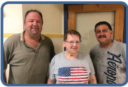
Our CES Team

Thank you BPS Custodial and Maintenance staff for all your hard-work in preparing our spaces for another amazing year of learning!