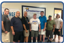
Our BHS Team