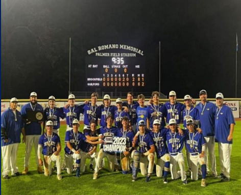
BHS FIRST TIME EVER- Baseball Class L State Champs!!